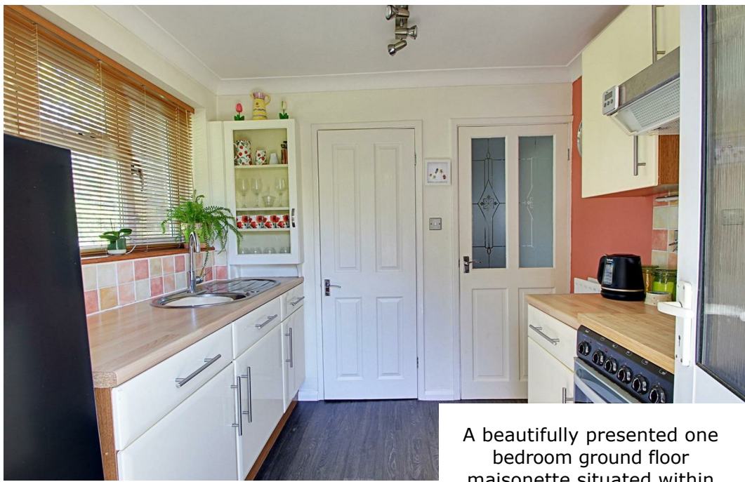
A beautifully presented one bedroom ground floor maisonette situated within walking distance of Kings Langley High Street and Station.